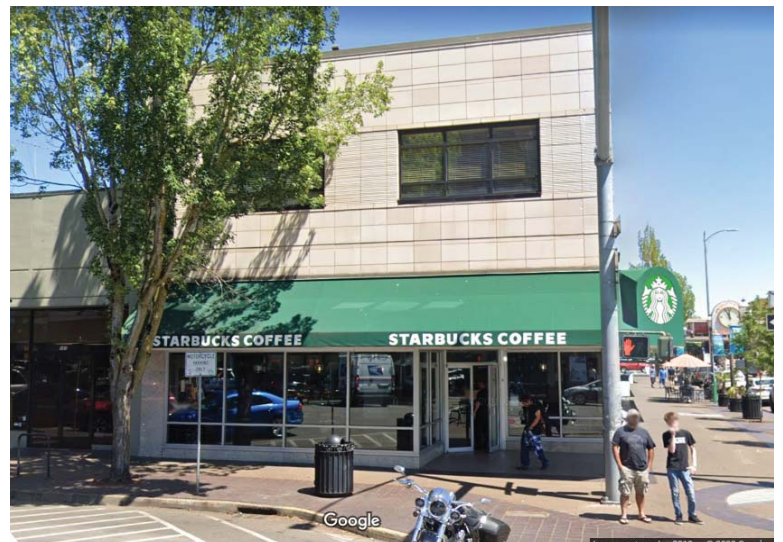
Left: Building as it looked about 1902. Photo Source Salem Public Library, Ben Maxwell Collection. Right: 2020 GoogleMaps