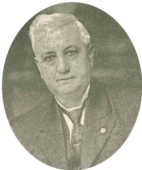
WHC Collections 64.1.1

Lots of things, but primarily he ran a cider/vinegar/carbonated drinks factory. He also farmed walnuts and prunes and served in the US Army during the Civil War and was super active in the G.A.R. (or Grand Army of the Republic) which was Veterans group for Union Army Vets. He also was an Alderman for the city of Salem (that is a city council member). Those were from just the first few articles that came up. Did you find more?