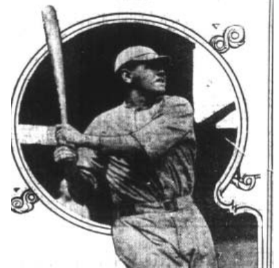
19 Dec 1926 Oregon Statesman pg 8

'Babe' Ruth Will Be in Salem Monday and Tuesday